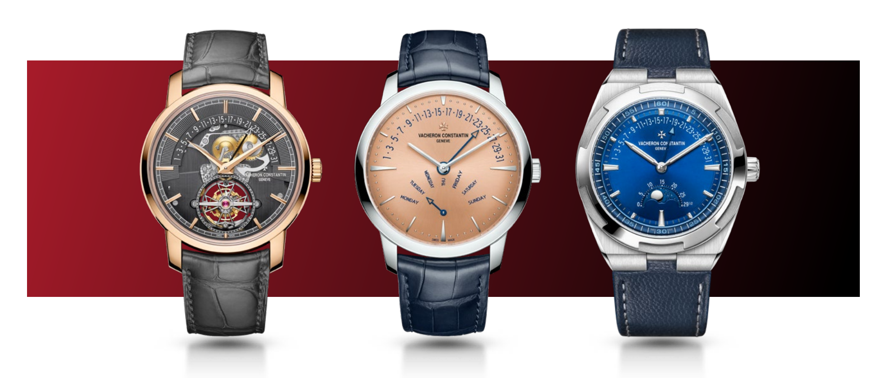
Traditionnelle Tourbillon Retrograde Date Openface (2023)

attention to detail. Minimalism expressed through the prism of the Maison thus translates into timepieces where mechanical sophistication is carefully choreographed, beautifully balanced shapes achieve a state of grace and craftsmanship gives life to matter.