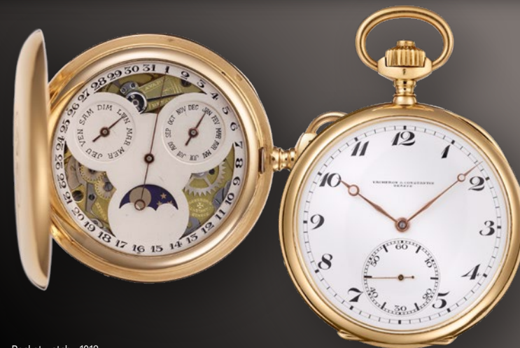
Pocket watch - 1918

In 2019, the Traditionnelle Twin Beat perpetual calendar was part of this dynamic, playing on the tensions between contemporary style and the power of tradition. It clearly marked a milestone. Two years later in 2021, a new interpretation was born: the Traditionnelle openface complete calendar. This stylish reference, presented in a 41 mm case in white or pink gold with an openworked sapphire dial, opened up new creative possibilities by combining watchmaking tradition/heritage with contemporary design.