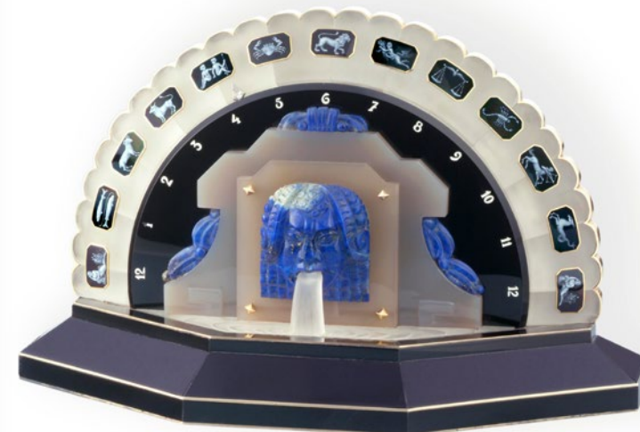
Yellow gold, onyx, rock crystal and lapis lazuli Art Deco clock (Ref. Inv. 10548) – 1927

Heir to the References 47245 and 47247 from the early Noughties, the Traditionnelle tourbillon date retrograde openface combines its retrograde display with a partially openworked dial, another signature of the Maison since the early 20 th century. Openface dials highlight the technical nature and the meticulous and consistent attention to detail through an avant-garde aesthetic approach. Housed in an 18K pink gold case measuring 41 mm in diameter and only 11.07 mm thick, this new timepiece is fitted with a grey alligator strap secured by a pink gold folding clasp.