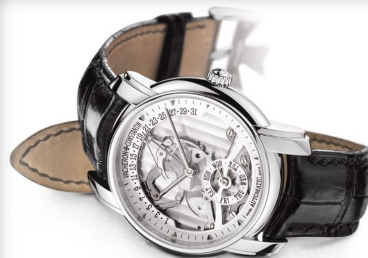
Skeletonized retrograde date platinum, Ref. 47247-2002