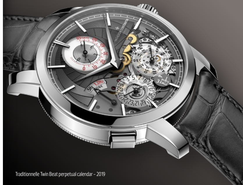
Traditionnelle Twin Beat perpetual calendar - 2019