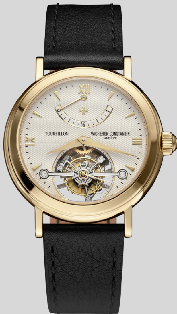
18K yellow gold tourbillon watch with power reserve indicator (reference 30050/000J – 1999)