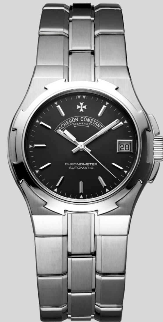
Stainless steel Overseas I watch with integrated bracelet (reference 42050 – 1998)

Created in 2000, the yellow gold “Historiques” chronograph watch (reference 47111) combines the aesthetic codes of the 1940s with 21st century technology. This piece is intended for collectors of vintage pieces benefiting from watchmaking developments of the 21st century.