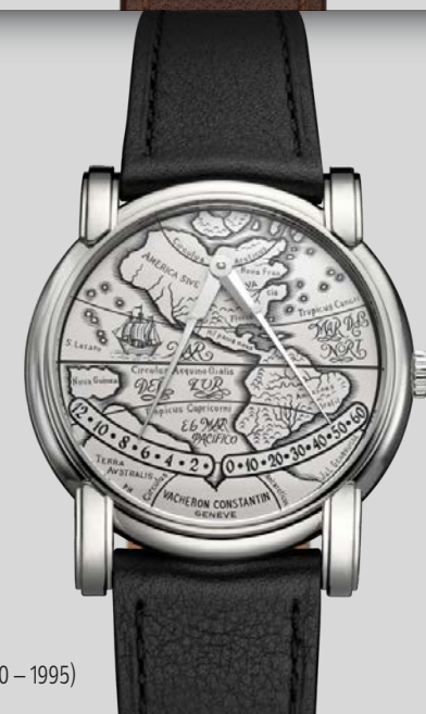
“Mercator” bi-retrograde watch in 950 platinum (reference 43050 – 1995)