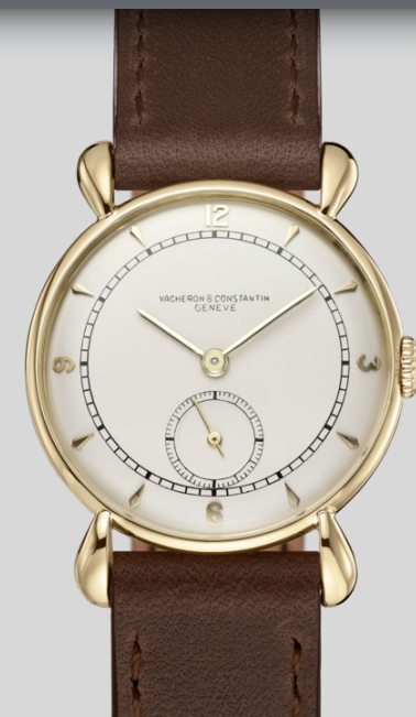
18K yellow gold watch (reference 4642 – 1952)

Created in 1995 to commemorate the 400th anniversary of the death of Flemish mathematician and geographer Gerhard Mercator, the “Mercator” bi-retrograde watch in 950 platinum (reference 43050) is characterized by an intricately hand-engraved and enamelled dial which reproduces the maps drawn by Mercator himself. Featuring a bi-retrograde display indicated by compass-shaped hands, the watch flaunts its originality while remaining sophisticated.