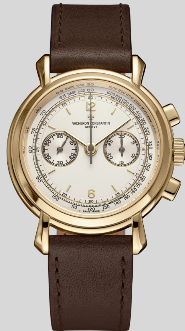
Yellow gold “Historiques” chronograph watch (reference 47111 – 2000)