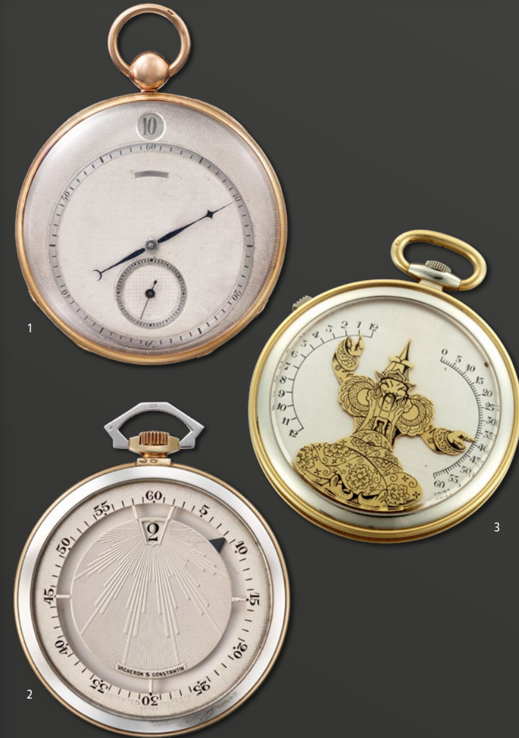
1. Pocket watch with jumping hour (Ref. Inv. 10132) - 1824 2. Pocket watch with jumping hour and minutes displayed beneath the dial by a hand (Ref. Inv. 10152) - 1929 3. "Arms in the air" two-tone yellow and white gold pocket watch, bi-retrograde display (Ref. Inv. 11060) -1930

This collaboration resulted in numerous creations between 1910 and 1930. This Art Deco period was conducive to letting the imagination roam free and indulging in the wildest extravagances. With the ever-increasing number of special-shaped 'form' watches, aperture-type date indications appeared, as did special displays, including jumping hours and retrograde minutes. One of the essential models that made Vacheron Constantin famous during these years was the 1930 "Bras en l'Air" (Arms in the Air) pocket watch with its double retrograde display. At the touch of the 10 o'clock pusher, the arms of a Chinese magician in engraved and enamelled gold rise up to indicate the hours and minutes. Another remarkable model dating from 1929 is a watch with jumping hour and minutes displayed beneath the dial by a hand of which only the onyx tip is visible.