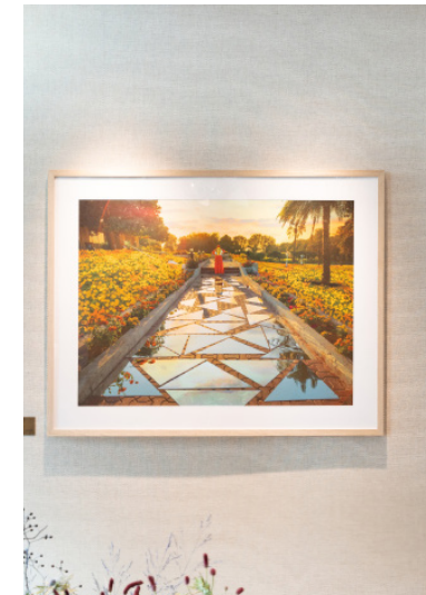
Lateefa bint Maktoum Path of Reflection. 2017. Archival print on paper.