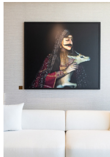
Meitha Demithan Gazelle. 2018. Scanography digital print.