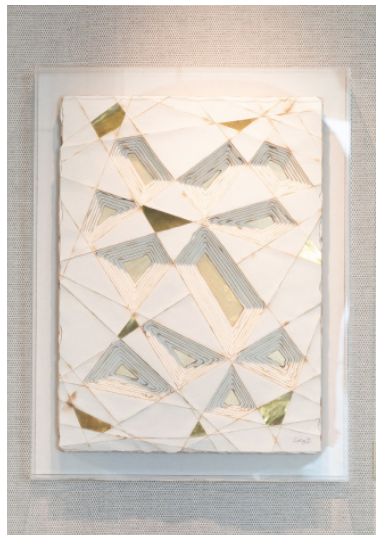
Juveriya Mahadi Untitled #10. 2022. Paper, fire, brass sheet metal, brass mesh, oil paint, gold leaf.