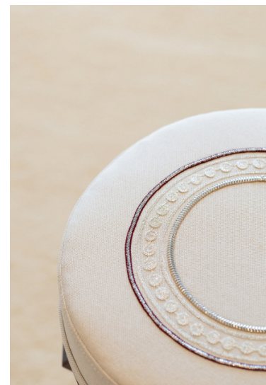
Muneerah Almullah , Artist

Designed through Clay Art, the intricate perlage elements located on the wall of the main area main area