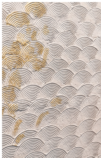
Abdulrahman Alham-madi , Artist

Designed through Clay Art, the intricate perlage elements located on the wall of the main area main area