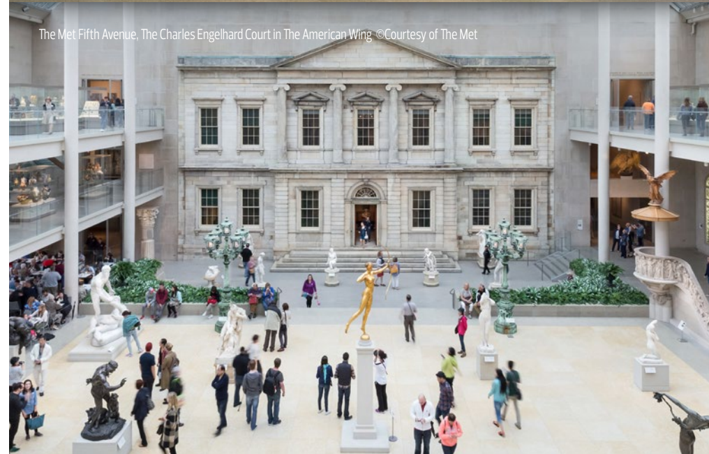
The Met Fifth Avenue, The Charles Engelhard Court in The American Wing