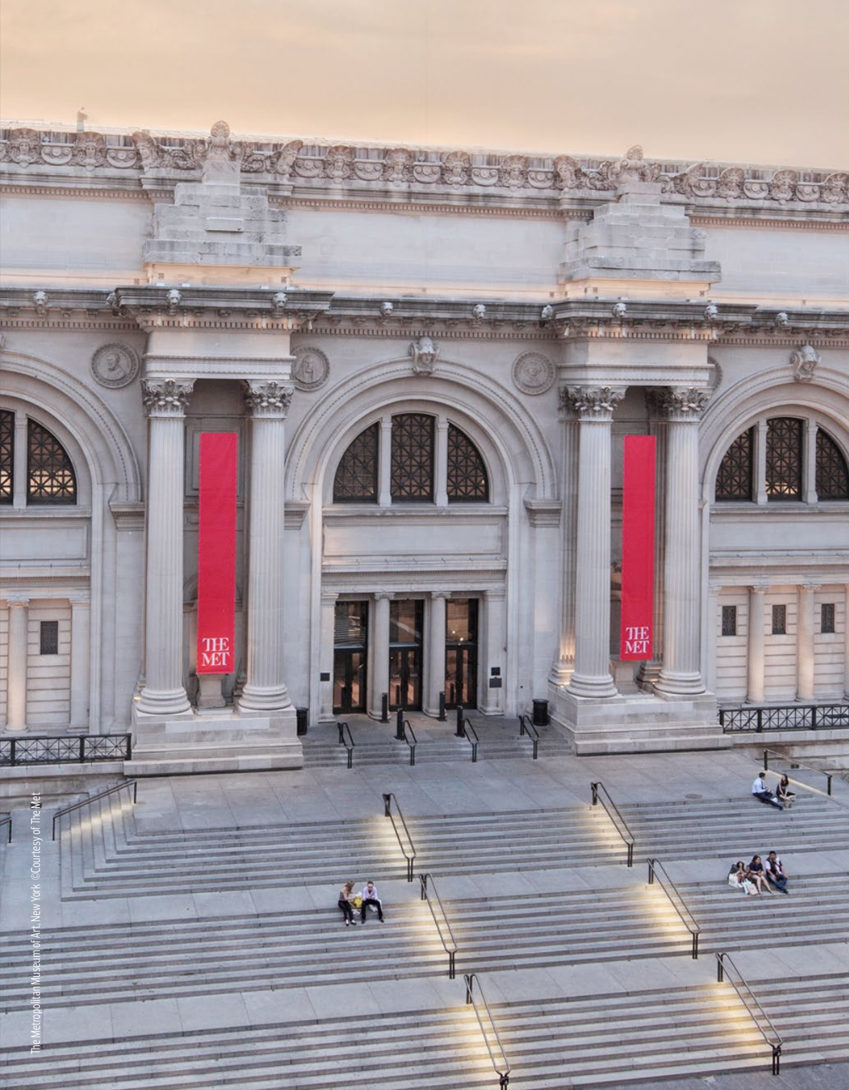
The Metropolitan Museum of Art, New York