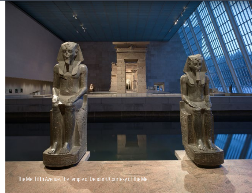
The Met Fifth Avenue, The Temple of Dendur

These programs include workshops, art-making experiences, specialized tours, fellowships supporting leading scholarship and research, high school and college internships that promote career accessibility and diversity, access programs for visitors with disabilities, K-12 educator programs that train teachers to integrate art into core curricula across disciplines, and school tours and programs that spark deep learning and lifelong relationships with and through art.