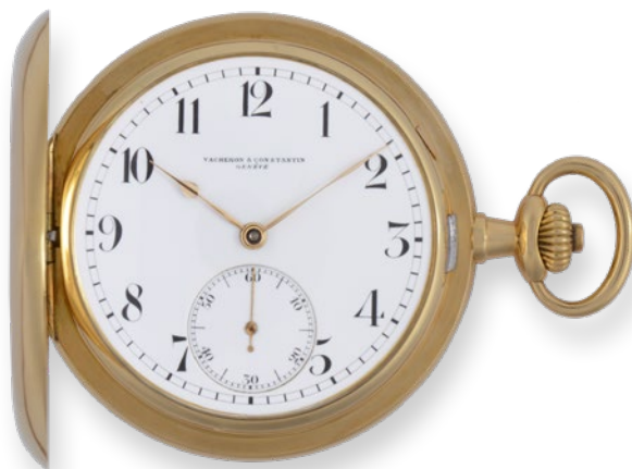
Pocket watch - 1898

I invite you take a step back in time! As early as the late 19 th century, timepieces embodying remarkable advances in terms of anti-magnetism and water-resistance marked the beginnings of the Maison's sports watches, such as the 1885 model resistant to magnetic disturbances and the 1898 pocket watch protected against humidity. The 1930s then saw the appearance of steel watches, characterised by a screw-down bezel and caseback and an unbreakable sapphire crystal. In the 1970s, Vacheron Constantin once again introduced several models designed for active life, including the 1975 Chronomètre Royal, the company's first steel watch with integrated bracelet, as well as the famous 222. The latter was a sports watch water-resistant to 120 metres that inspired the creation of the first Overseas models in 1996, driven by the spirit of travel and openness to the world. This remarkably technical collection quickly became a benchmark for the brand, and its codes evolved over time, particularly with regards to the metal bracelet, which as of 2004 featured a motif evoking the brand's Maltese cross emblem. In 2016, the certified new-wave Overseas resolutely took its place in the 21 st century and marked a new aesthetic signature for timepieces destined to become true travel companions.