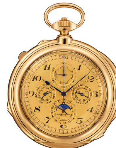
King Fouad/ Farouk Pocket watch - 1929

Constantin opened its doors in The Dubai Mall in September 2015.